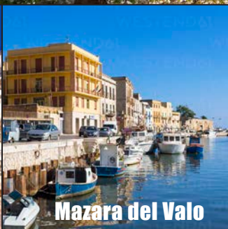
Mazara del Vallo